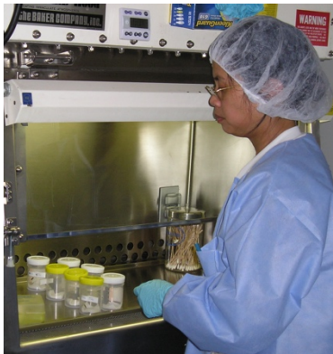
Disinfection processing under sterile hood

Not just for humans, Medicinal Maggots™ have proven to be a highly effective treatment for infected and non-healing animal wounds too. Our products have been widely utilized in veterinary care providing a natural and inexpensive solution for hoof and other wounds. Contact us at 949-679-3000 or sales@monarchlabs.com to order and request special pricing. We also manufacture custom veterinary products upon request and with advanced notice. Additionally, we can arrange to have an equine maggot therapy consultant available to answer your questions by phone or video, if necessary.