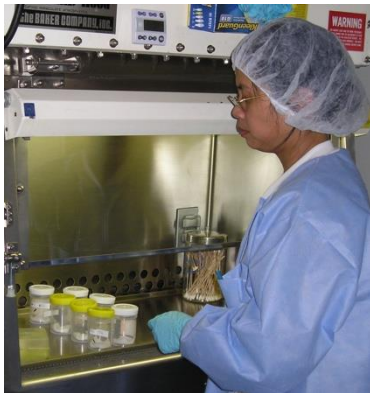
Disinfection processing under sterile hood

Call us for veterinary products and services: 949-679-3000.